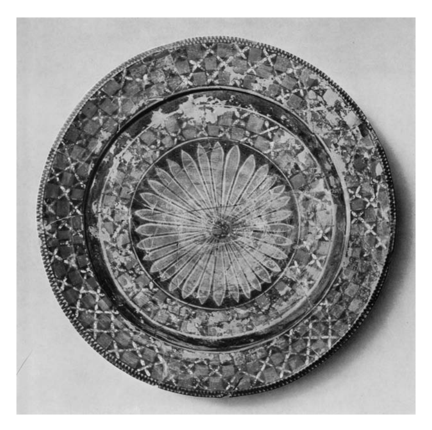
Figure 1. Halaf ware bowl from Arpachiyah, diameter 33 cm, Iraq Museum, Baghdad. (Strommenger 1962: pl. II) For most periods of ancient Iraq, pottery provides the chronological framework essential for understanding the successive levels of occupation of a site. During the course of an archaeological excavation, hundreds of thousands of potsherds are collected and recorded. The smallest fragment may be as valuable as an intact vessel for enriching our knowledge of techniques, artistic developments, and interconnections. When the Iraq Museum storerooms were ransacked in April 2003, the excavated pottery and other artifacts awaiting study and final publication were thrown into disorder or stolen.

purpose.<sup>22</sup> But this was exceptional. Most villages comprised a few dozen houses, all of the same size and plan, suggesting an egalitarian society, with communal as well as individual storage facilities. Perhaps resources of fields and flocks were also managed communally.